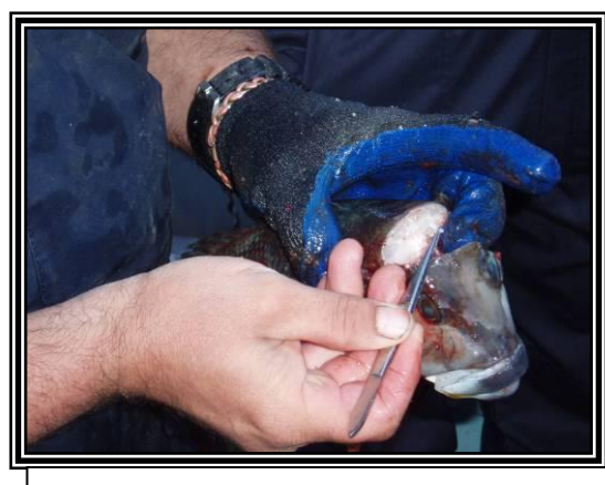
Blue Cod undergoing dissection