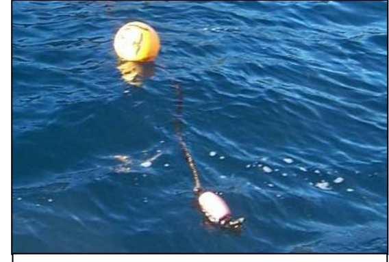
Buoys indicating commercial lobster pot