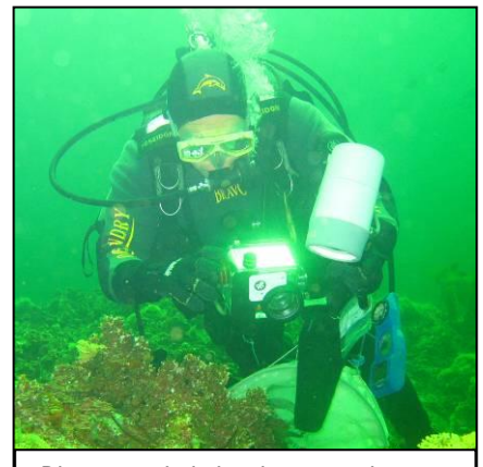
Diver at work during the research

The first project was aimed at carrying out a comprehensive survey of the 'china shop' areas of the fiords, which are areas notable for containing particularly high diversity or high abundance of uncommon or fragile species. The data collected is still being worked through, but observations on the trip were that each china shop had distinctive characteristics, some with extremely high diversity of species, and that a number of new and undescribed species have been found.