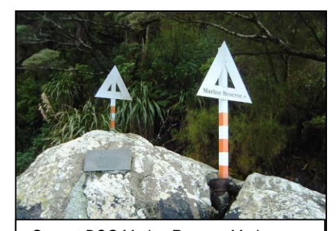
Current DOC Marine Reserve Markers

Currently just one of Fiordland's ten reserves, Te Awaatu Channel (The Gut) Marine Reserve, is marked with large white triangle markers (a common method for DOC to mark their boundaries). It has been decided that the other two reserves in Doubtful Sound will be marked in the same manner for consistency, but the reserves outside of Doubtful Sound will be marked in a manner more in keeping with the wilderness values of those areas. A