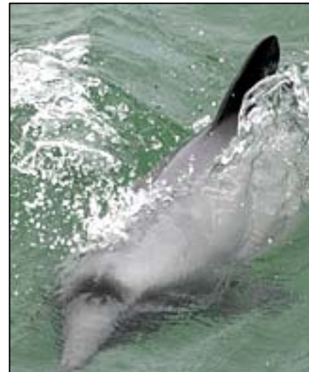
Photograph of Dolphin