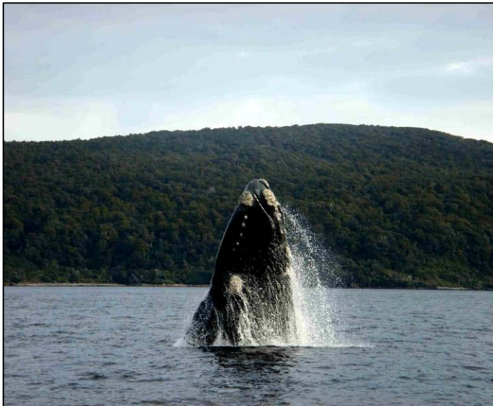
Photograph of whale in the Fiordland Marine Area.

The Cuttle Cove Whaling Station was established in 1829 in Preservation Inlet, to take advantage of the migration of southern right whales/Tohorā from the southern ocean to warmer waters. This shore based whaling station was one of the first in New Zealand, and was set up to take oil, as opposed to just baleen. The station was managed by Peter Williams on behalf of the owners, Sydney merchants Bunn and Company. In 1829 the station produced 120 ‘tuns’ of oil, a ‘tun’ being estimated at 252 gallons, or roughly a ton in weight.