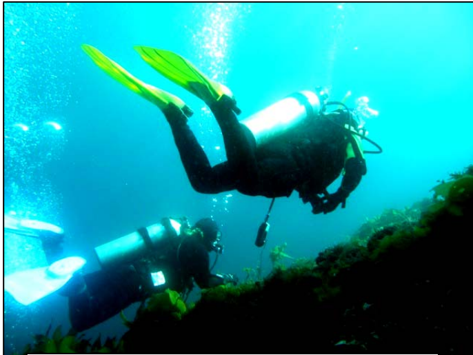
Divers vigilantly searching for Undaria in Sunday Cove

Undaria is a fast-growing seaweed that can spread rapidly, displacing native species, and having major impacts on marine ecosystems. It could have devastating impacts on the unique Fiordland marine environment.