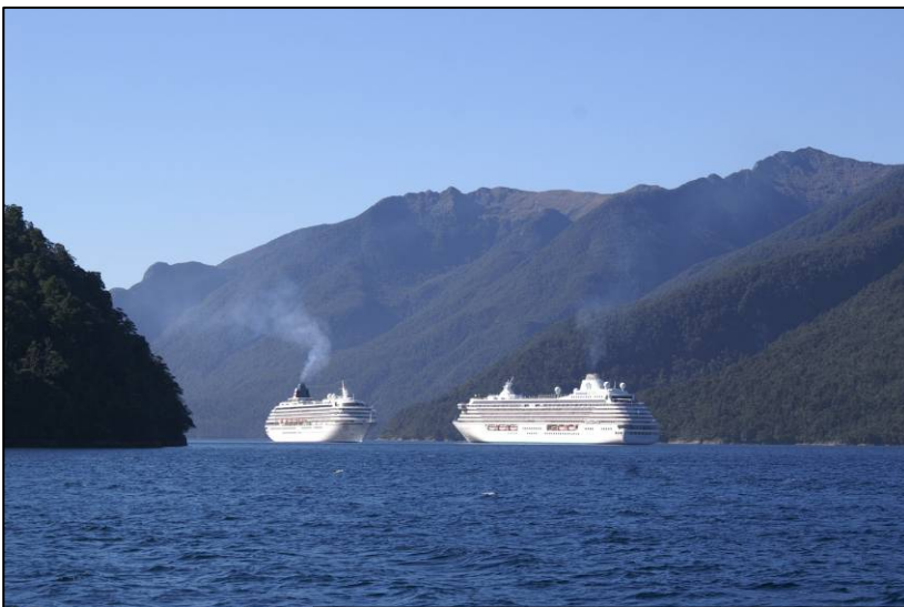
Two Cruise Ships pass while in Thompson Sound.

Other issues that have arisen from the loss of the Costa Concordia .