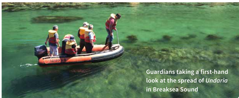
Guardians taking a first-hand look at the spread of Undaria in Breaksea Sound