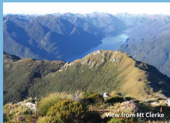
View from Mt Clerke

Lyndon Cleaver commented that linking up the Mount Clerke and Wednesday Peak sites provides almost complete cover from Mount Clerke to Bluff, which dramatically improves communication options for boaties.